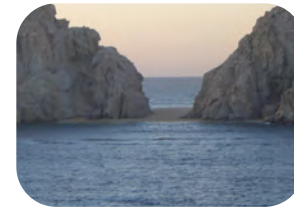
ENERGY POLICY DEVELOPMENT & DIRECTION

We firmly believe that our continued success lies in our commitment to those we serve. In the public eye or behind the scenes, the 360 Energy Group extends your reach beyond your in-house capabilities. From Fortune 500 companies to Federal agencies, the 360EG Team has provided our world-class service offerings to a wide variety of clients. Accolades and success stories belong to our clients, which is why you'll never hear us name dropping for leverage. We value your limelight and happily ensure your goals are met without disclosing our involvement.