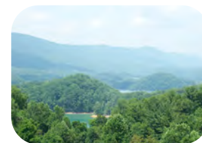
BUSINESS PROCESS REENGINEERING