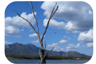
STRATEGIC MARKETING & PUBLIC RELATIONS