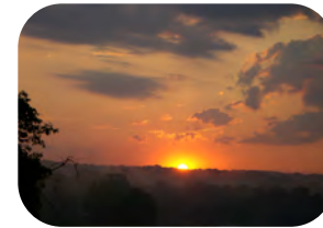
FINANCING PROGRAM DEVELOPMENT