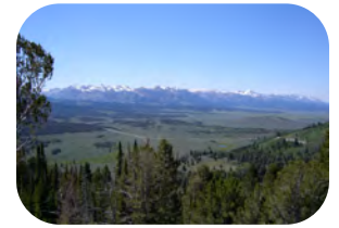
ENERGY CONSERVATION CONSULTING