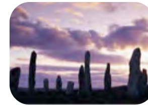
ENERGY INDUSTRY RESEARCH & ANALYSIS