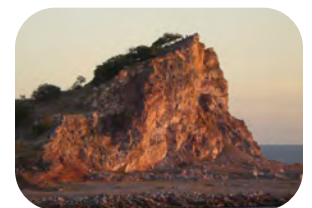
STRATEGIC ALLIANCE BUILDING